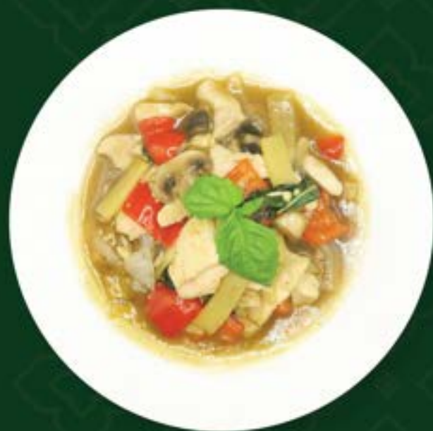
Pork Stir Fried Thai Basil

Chicken 17.50 / Pork 17.50 / Tofu 17.50 / Veggie 17.50 / Beef 19.50 / Shrimp 19.50 / Squid 19.50