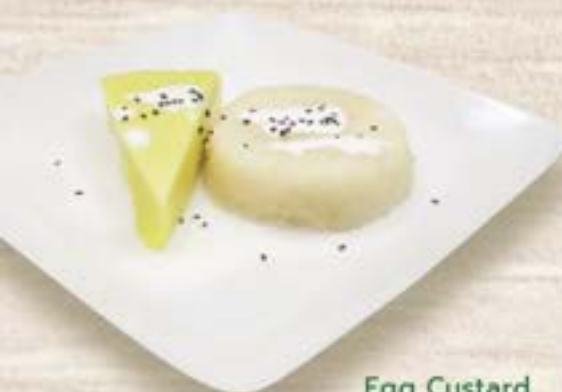
Egg Custard Sticky Rice

Sweet and suave egg custard which melts in your mouth served with sticky rice, sweet coconut milk, and a sprinkle of sesame seeds.