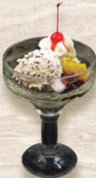
Toasted Coconut Ice Cream

A full scoop of rich flavor toasted coconut ice cream garnished with various Asian toppings and served in a margarita glass.