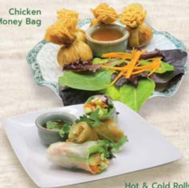
Hot & Cold Rolls

A6. Fresh Spring Rolls (2 pcs) 7.95 Lettuce, spring mix, cucumber, carrot, rice noodle, ham, omelet, mint, wrapped in Vietnamese style rice paper served with sweet chili sauce. Vegan tofu spring rolls are also available.