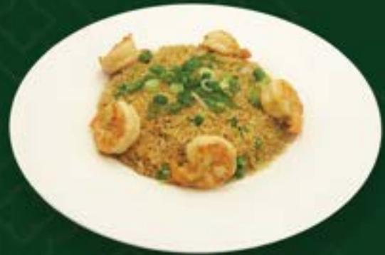
Shrimp Fried Rice

Special Fried rice with shrimps and chicken, pineapple pulps, egg, green peas, onion, and our homemade fried rice sauce with a touch of yellow curry powder.