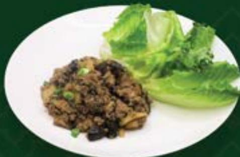
Pork Lettuce Wrap