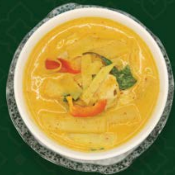
Pork Red Curry

Slow-cooked beef brisket stewed in Massaman curry with potato, carrot, onion, and served with a few slides of avocado on the surface. Other choices of protein are also available.