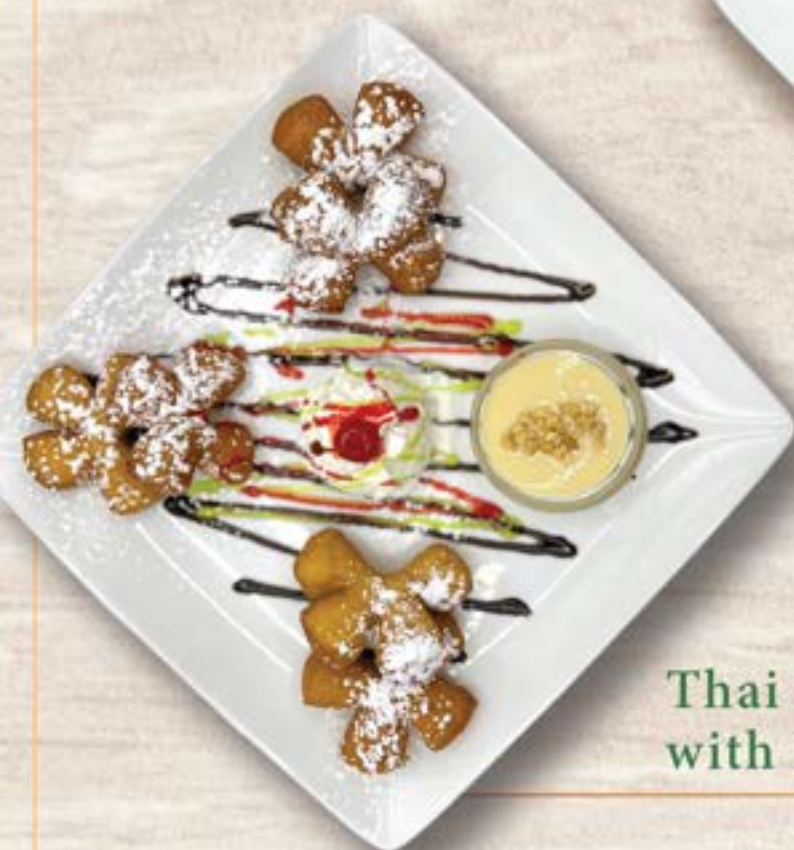
Thai Donut with Ice Cream