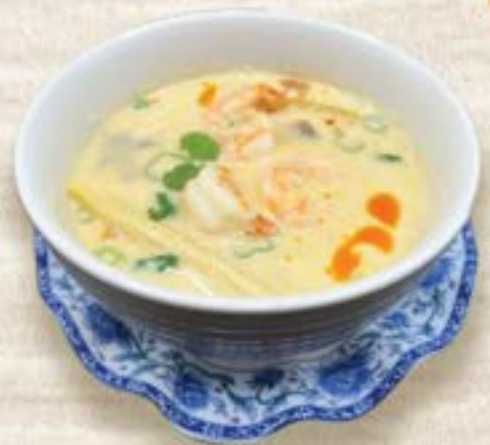
Shrimp Tom Kha

Distinct hot and sour flavor soup enriched with fragrant spices and herbs in the broth, simmered with shrimps or chicken, baby corn, mushroom, and tomato, then garnished with a sprinkle of cilantro and scallion.