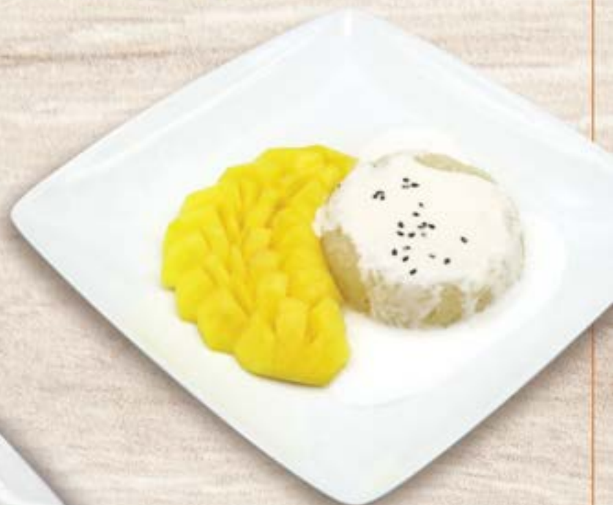
Mango Sticky Rice