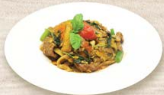
Beef Drunken Noodle

Clear noodles stir fried with your choice of protein, egg, broccoli, baby corn, carrot, onion, scallion, mushroom, and stir fry sauce.