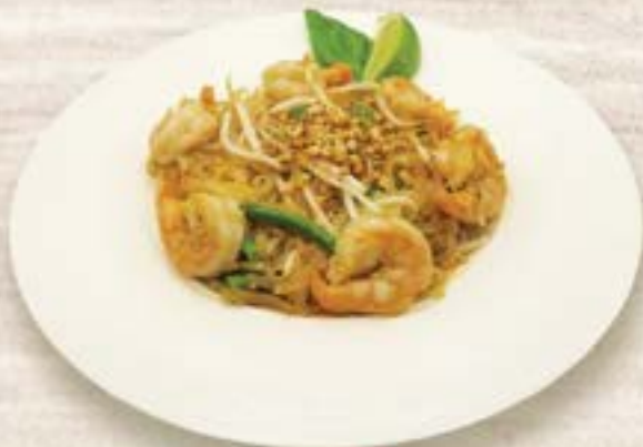
Shrimp Pad Thai

Chicken 17.50 / Pork 17.50 / Tofu 17.50 / Veggie 17.50 / Beef 19.50 / Shrimp 19.50 / Squid 19.50