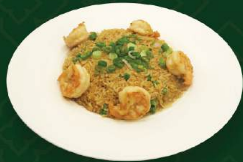
Shrimp Fried Rice

Special Fried rice with shrimps and chicken, pineapple pulps, egg, green peas, onion, and our homemade fried rice sauce with a touch of yellow curry powder.