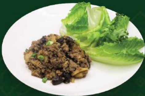
Pork Lettuce Wrap

Clear noodles & tofu boiled in vegetable broth with sprinkles of scallion, cilantro, and fried garlic.