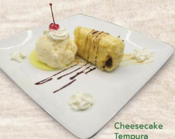
Cheesecake Tempura with Ice Cream

Indulge in a delightful treat with our Fried Banana with Ice Cream dish. Crispy fried bananas paired with creamy, sweet ice cream for a truly sensational Thai dessert experience.