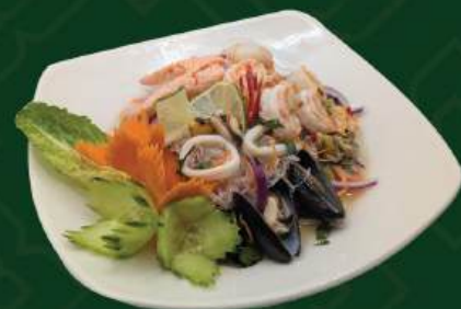
Thai Glass Noodle Salad

Lettuce, carrot, tomato, onion, tofu, cucumber, and avocado served with a choice of peanut sauce or balsamic vinaigrette dressing.