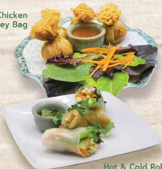
Hot & Cold Rolls