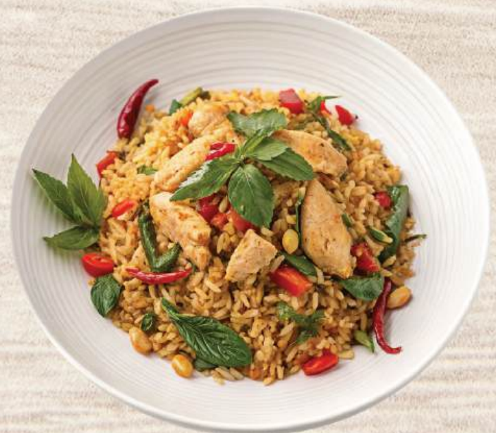
Inferno Fried Rice

Basil Fried rice known as **Kao Pad Nam Prik Pao** , features aromatic jasmine rice, expertly stir-fried to perfection and infused with the fragrant essence of Thai sweet basil. With your choice of protein, baby corn, bamboo shoot and bell pepper sautéed to perfection and combined with vibrant vegetables and a spicy kick from Thai chili paste.