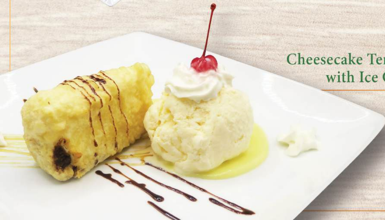
Cheesecake Tempura with Ice Cream