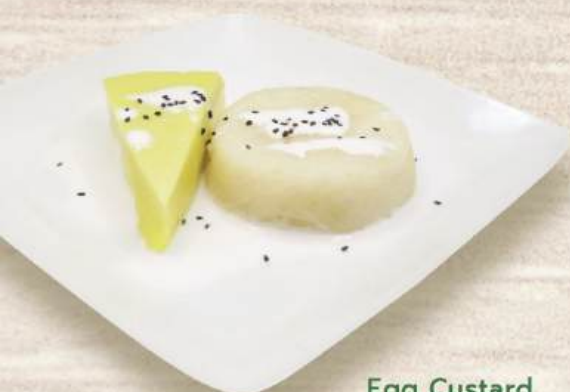
Egg Custard Sticky Rice