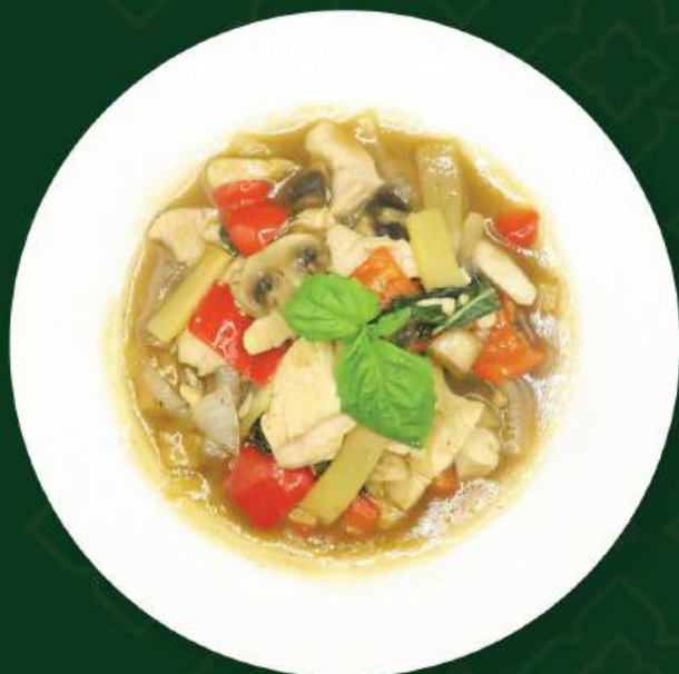
Pork Stir Fried Thai Basil

Chicken 22.00 / Pork 22.00 / Tofu 22.00 / Veggie 22.00 / Beef 24.50 / Shrimp 24.50 / Squid 24.50 / Scallop 29.00