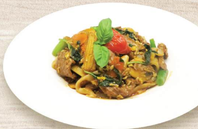
Beef Drunken Noodle

Our delicious crispy egg noodles with savory gravy sauce, your choice of protein, bamboo shoots, broccoli and carrots. A comforting and satisfying dish for any noodle lover.