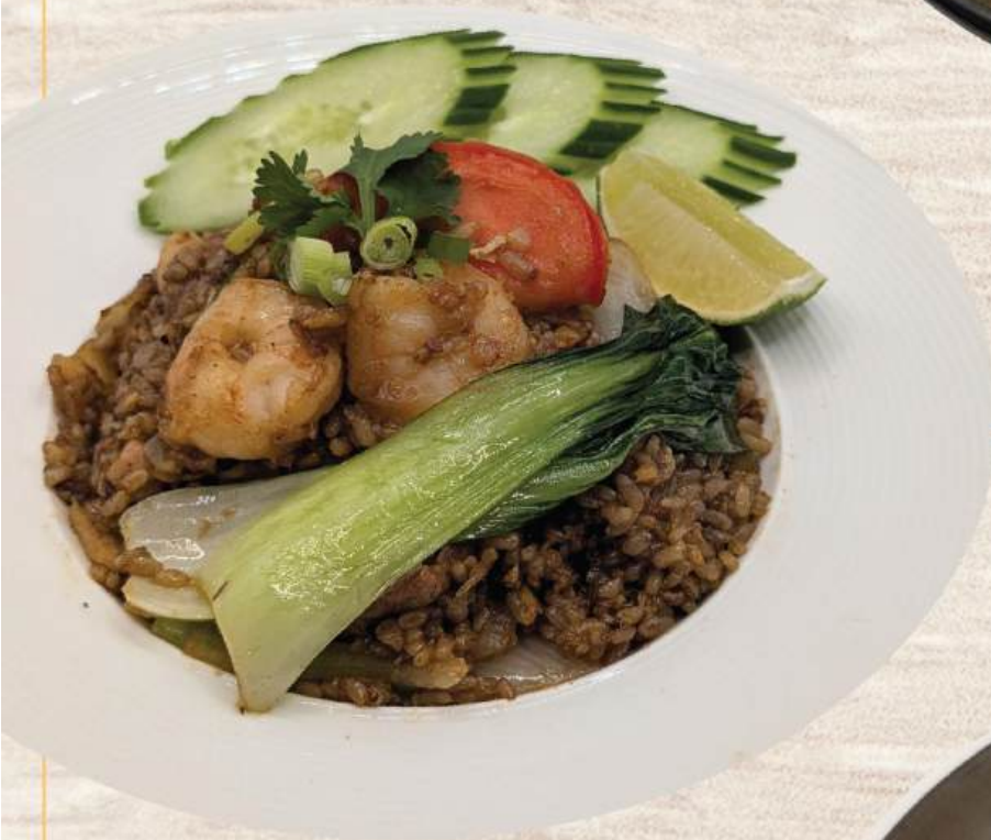
Volcano Fried Rice