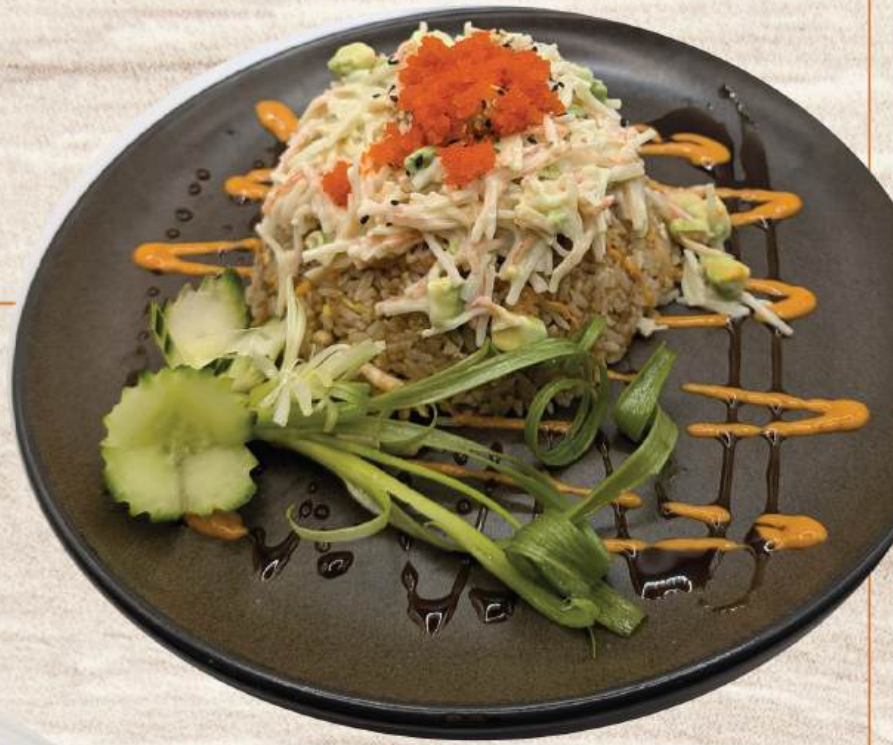
Hearty Fried Rice