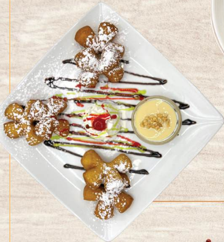
Fried Banana with Ice Cream