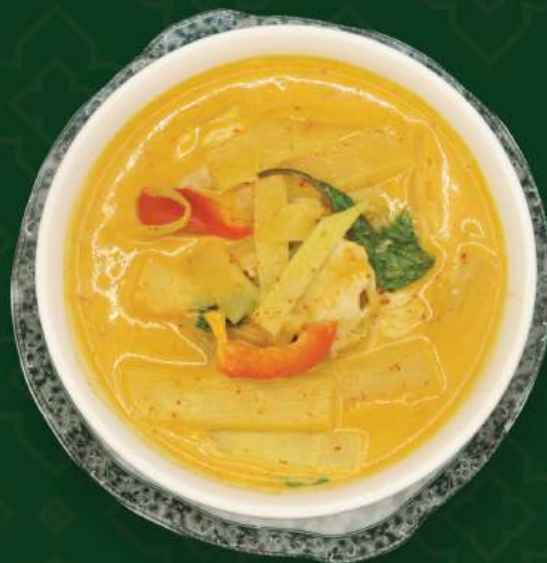
Pork Red Curry

Slow-cooked beef brisket stewed in Massaman curry with potato, carrot, onion, and served with a few slides of avocado on the surface. Other choices of protein are also available.