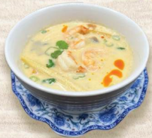
Shrimp Tom Kha

Distinct hot and sour flavor soup enriched with fragrant spices and herbs in the broth, simmered with shrimps or chicken, baby corn, mushroom, and tomato, then garnished with a sprinkle of cilantro and scallion.