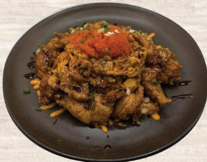
Volcano Fried rice