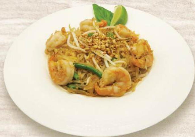
Shrimp Pad Thai