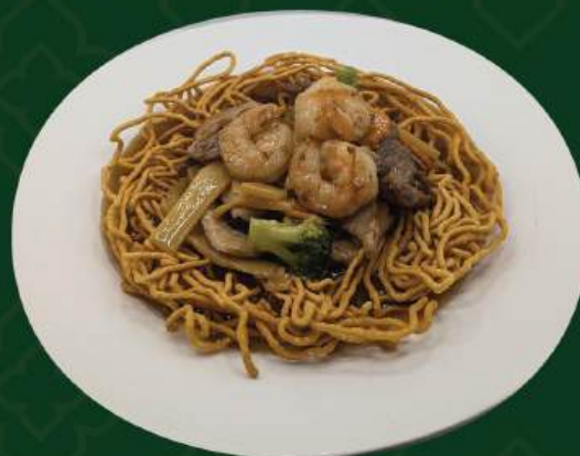
Mee Krob Lad Nah

Clear noodles stir fried with your choice of protein, egg, bean sprout, ground peanut, scallion, and our homemade savory Pad Thai sauce.