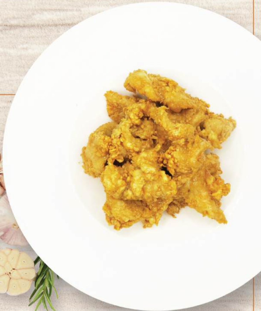
Thai Crisp Chicken